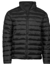
Lite Jacket | Style 9644