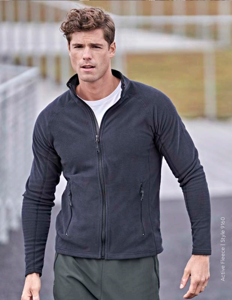
Active Fleece | Style 9160