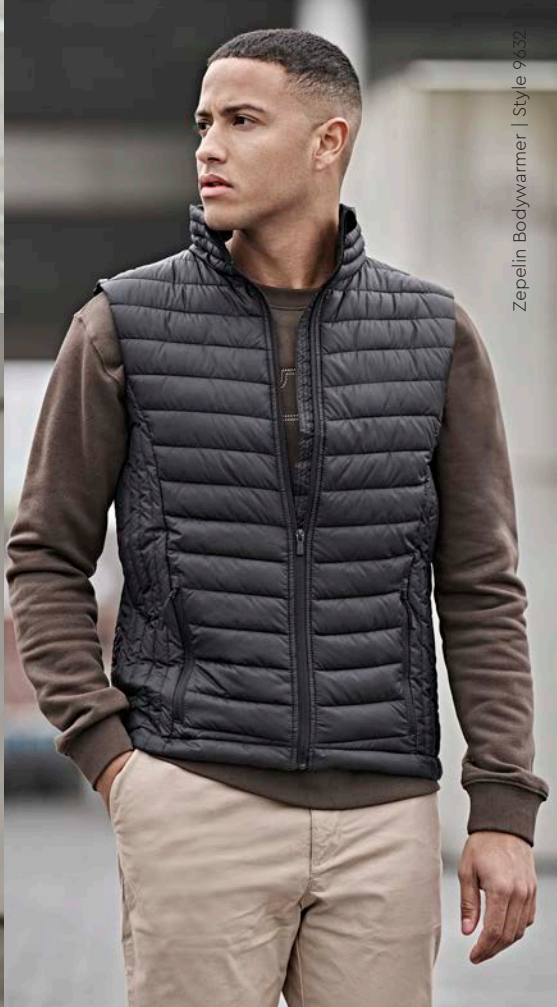
Zepelin Bodywarmer | Style 9632