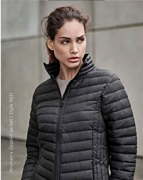
Women's Zepelin Jacket | Style 9631