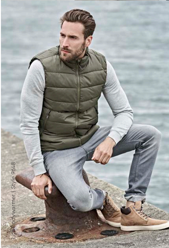
Lite Bodywarmer | Style 9648