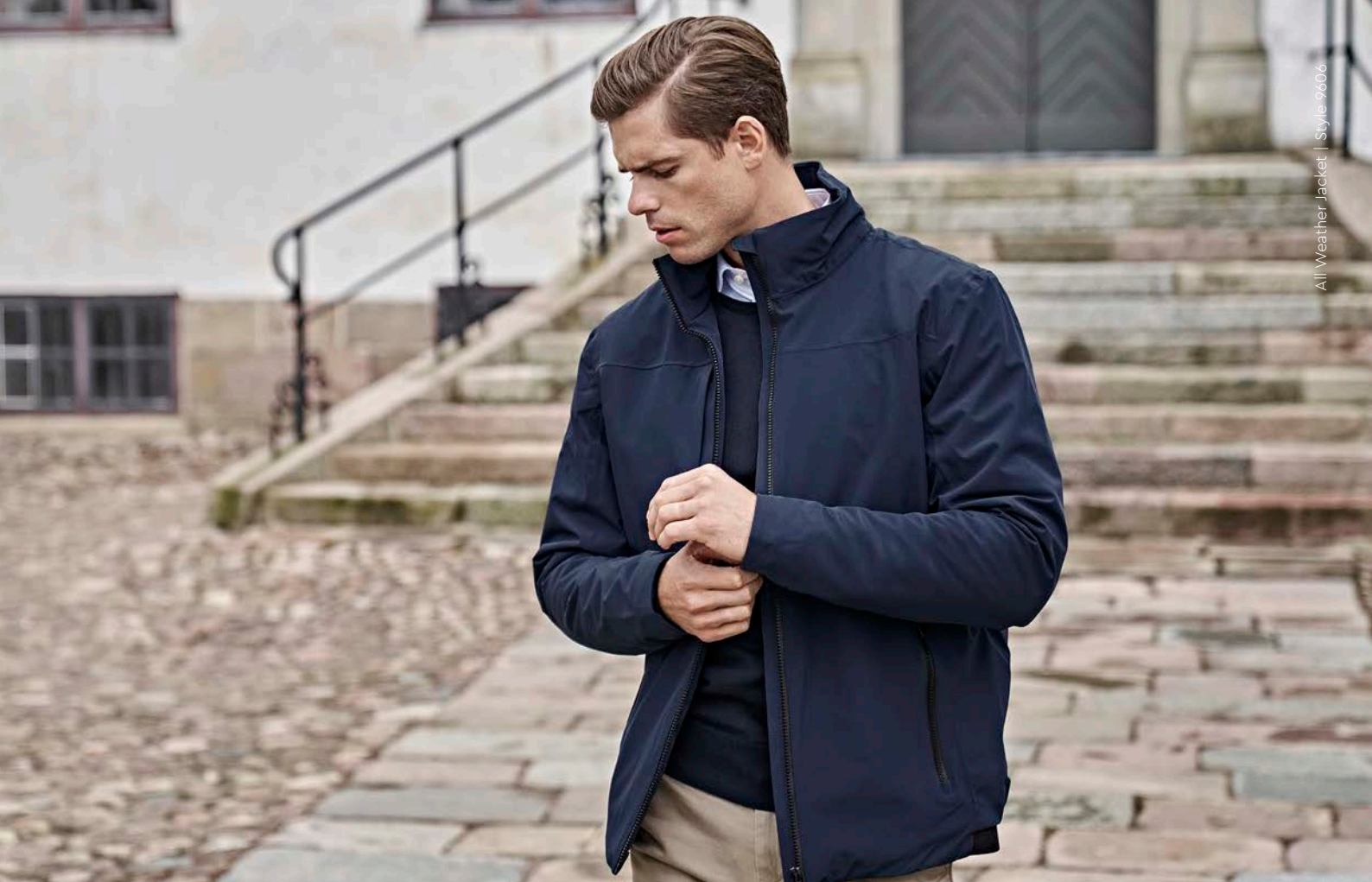
All Weather Jacket | Style 9606