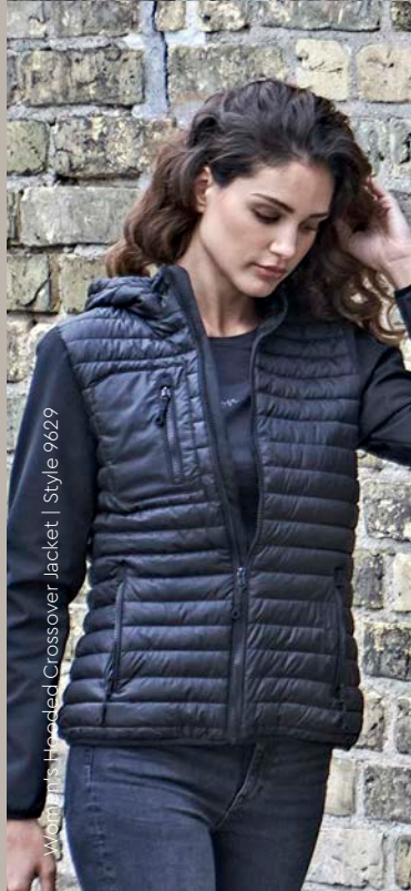
Women's Hooded Crossover Jacket | Style 9629