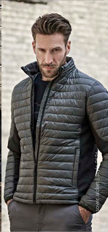
Crossover Jacket | Style 9626