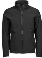
All Weather Jacket | Style 9606