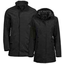
All Weather Parka | Style 9608 / 9609