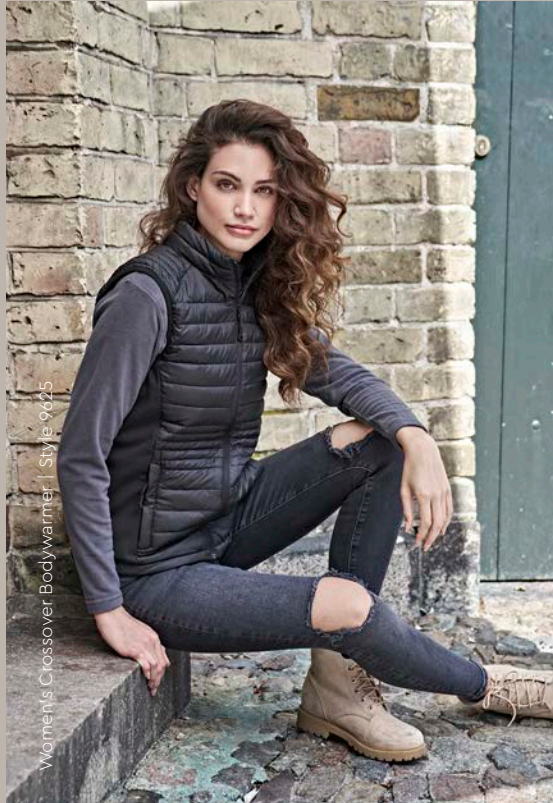
Women's Crossover Bodywarmer | Style 9625