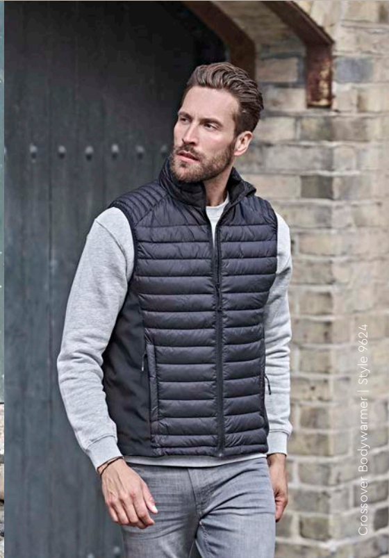
Crossover Bodywarmer | Style 9624