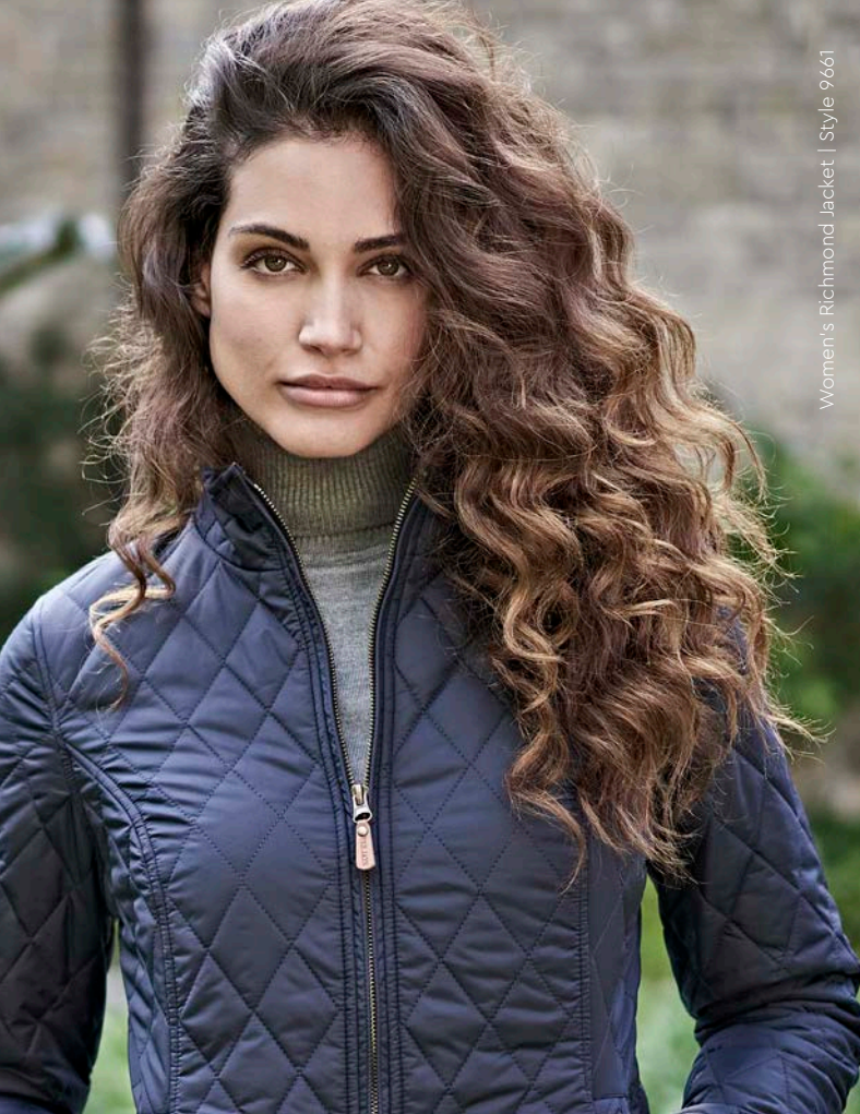
Women's Richmond Jacket | Style 9661