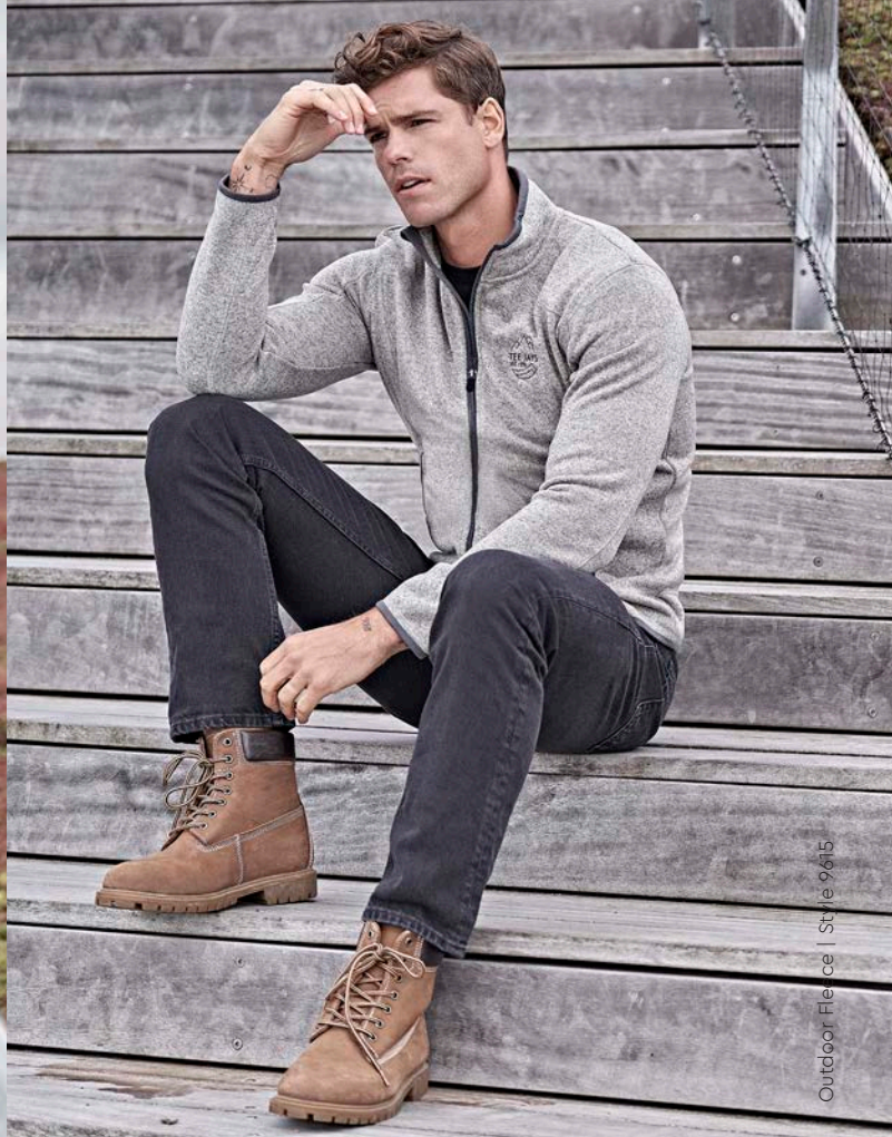
Outdoor Fleece | Style 9615