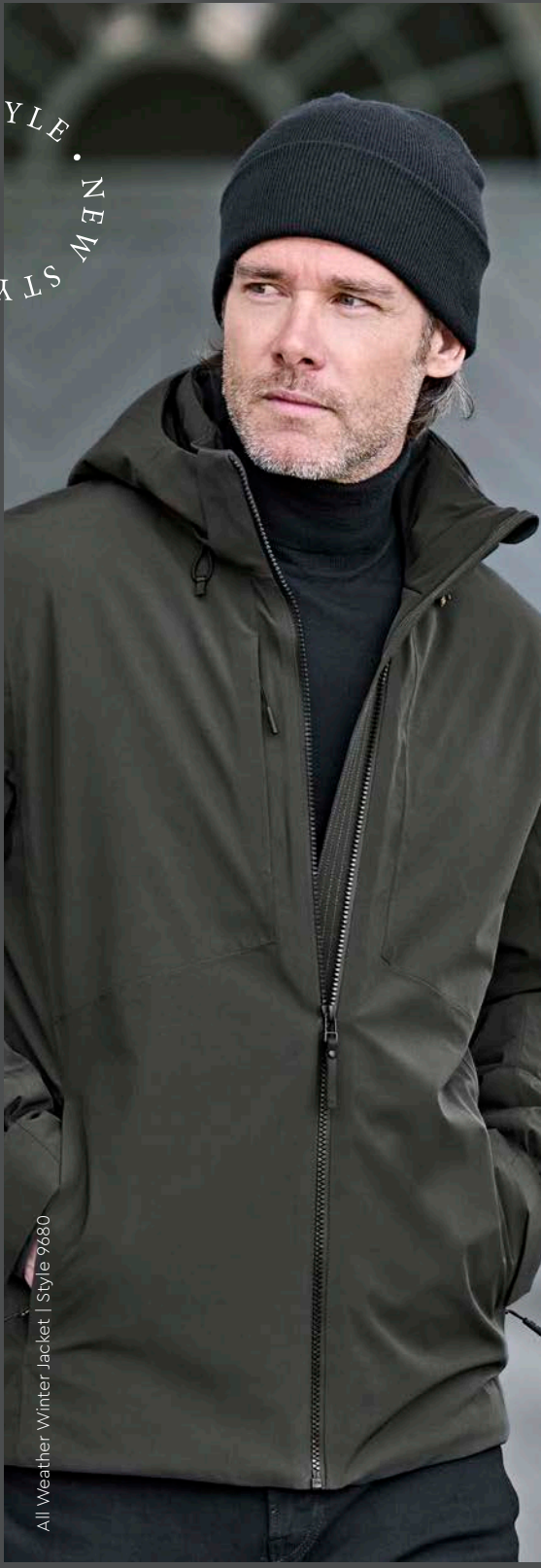
All Weather Winter Jacket | Style 9680