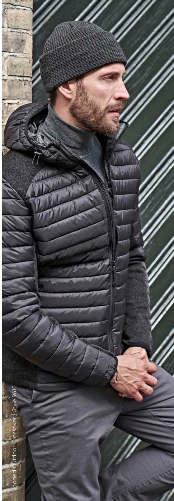
Hooded Outdoor Crossover | Style 9610