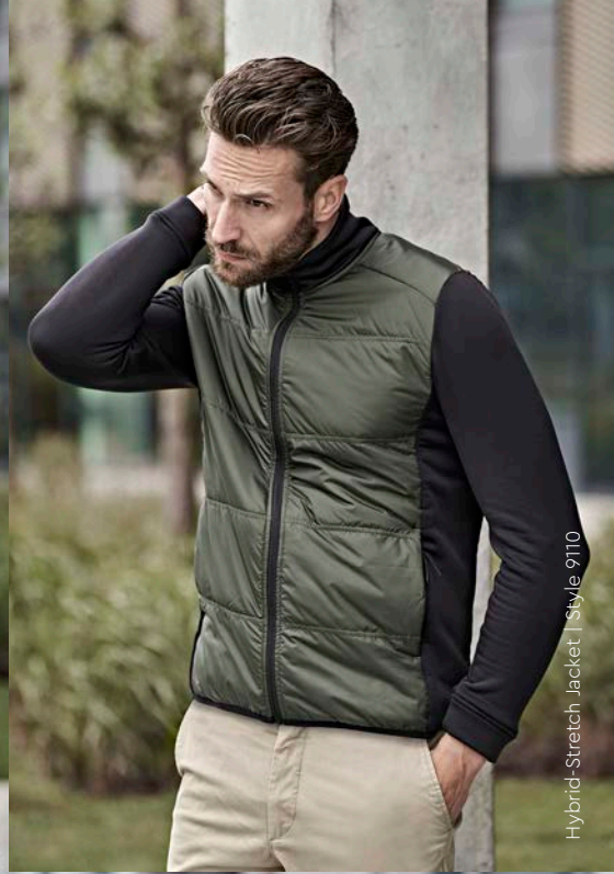
Hybrid-Stretch Jacket | Style 9110