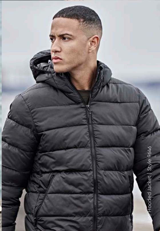
Lite Hooded Jacket | Style 9646