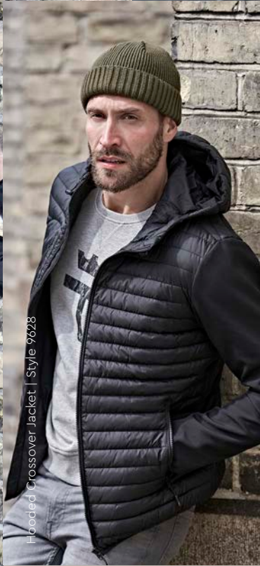
Hooded Crossover Jacket | Style 9628