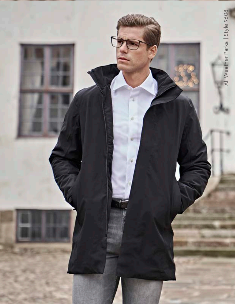
All Weather Parka | Style 9608