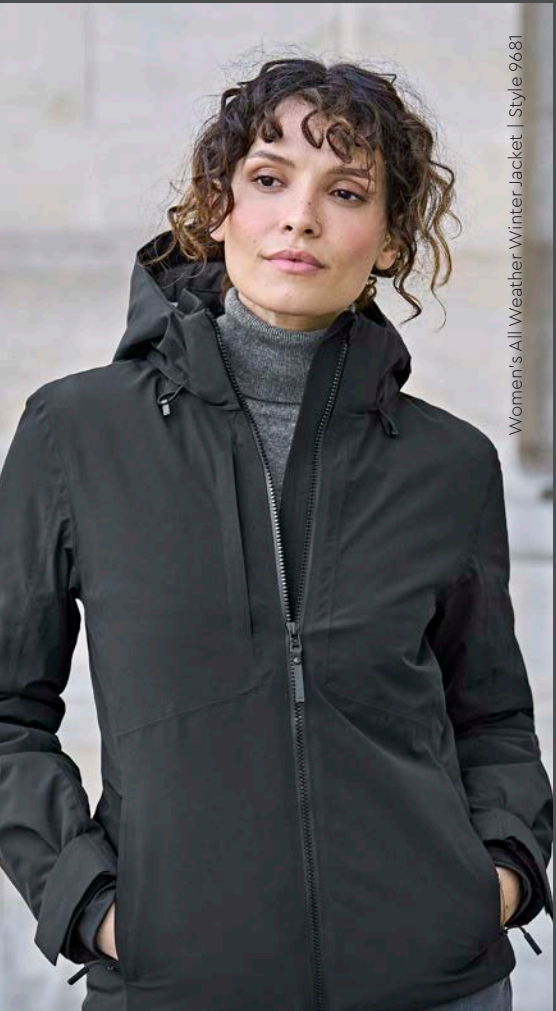
Women's All Weather Winter Jacket | Style 9681