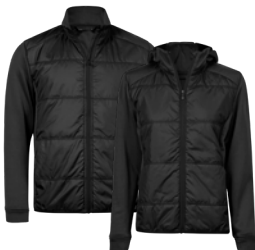
Hybrid-Stretch Jacket | Style 9110 / 9113