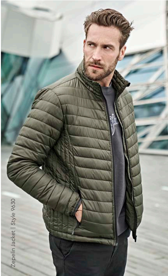
Zepelin Jacket | Style 9630