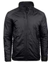
Newport Jacket | Style 9600