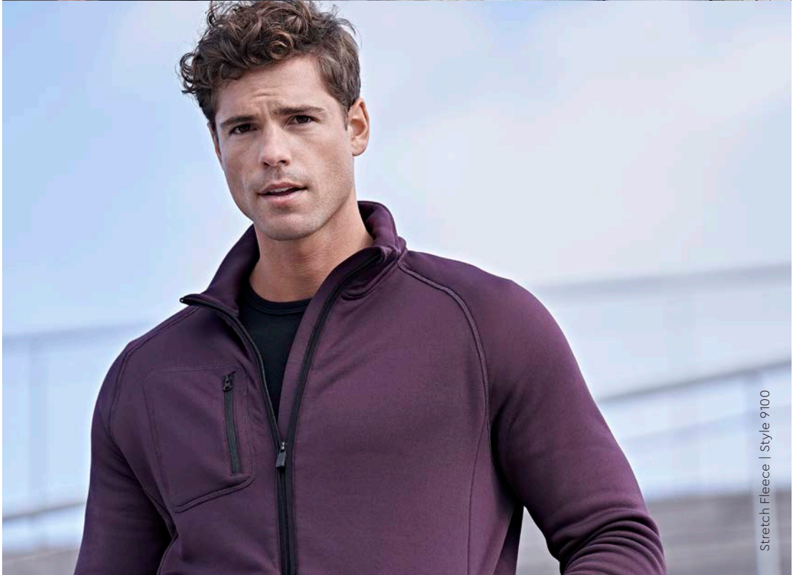
Stretch Fleece | Style 9100