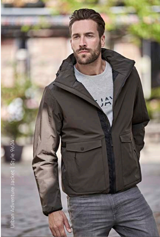
Urban Adventure Jacket | Style 9604