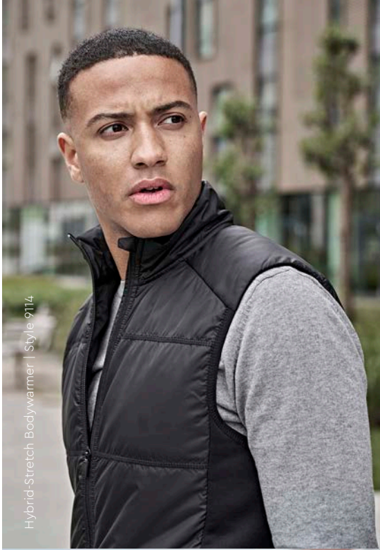
Hybrid-Stretch Bodywarmer | Style 9114