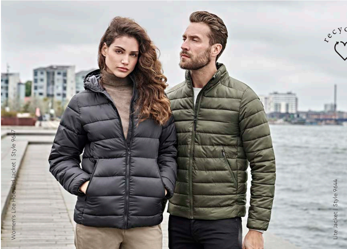
Women's Lite Hooded Jacket | Style 9647