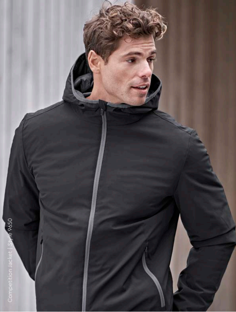
Competition Jacket | Style 9650