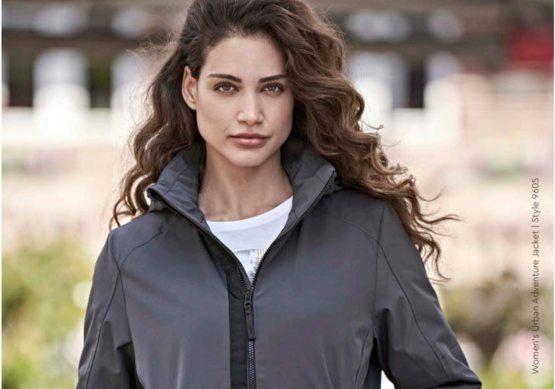
Women's Urban Adventure Jacket | Style 9605