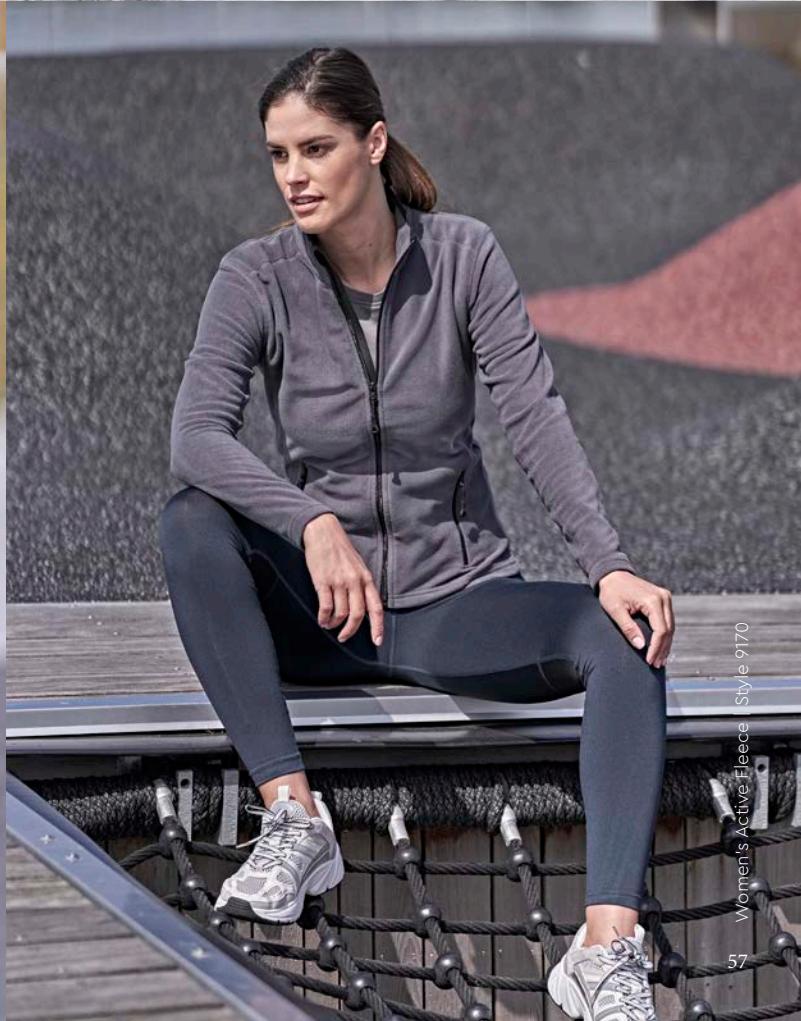
Women's Active Fleece | Style 9170