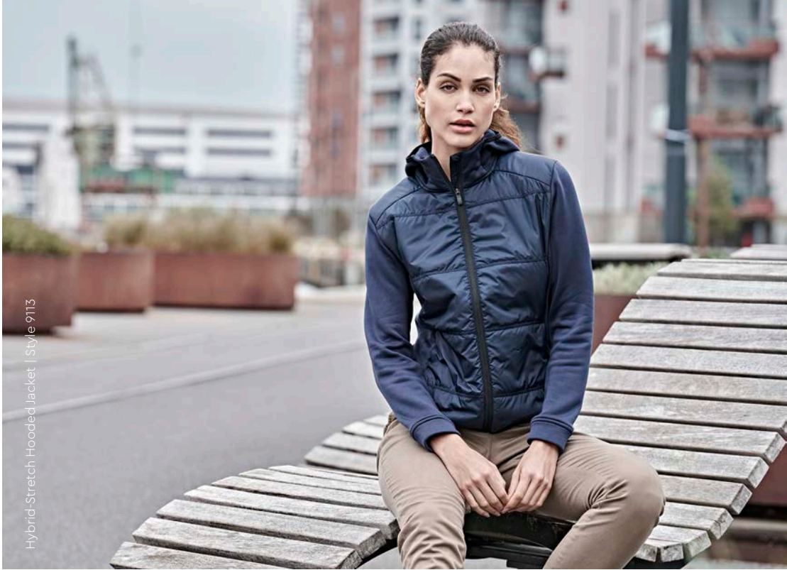
Hybrid-Stretch Hooded Jacket | Style 9113