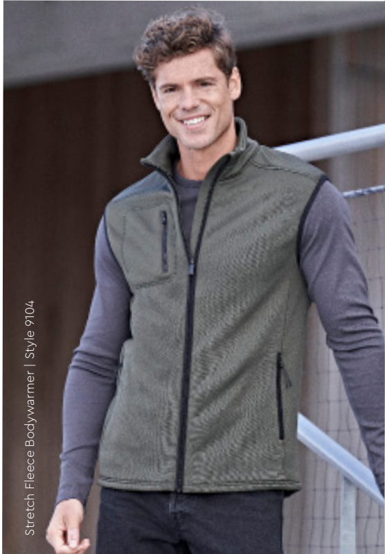
Stretch Fleece Bodywarmer | Style 9104