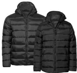
Lite Hooded Jacket | Style 9646 / 9647