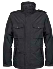
Urban City Jacket | Style 9670