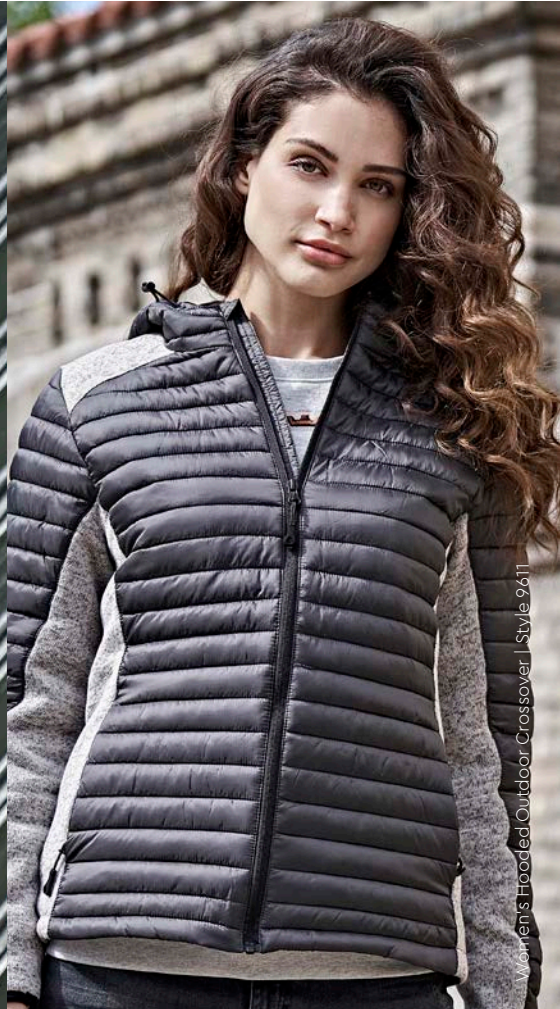
Women's Hooded Outdoor Crossover | Style 9611