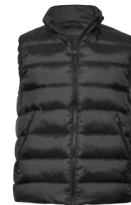
Lite Bodywarmer | Style 9648