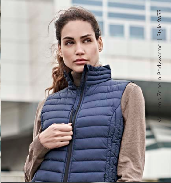
Women's Zepelin Bodywarmer | Style 9633