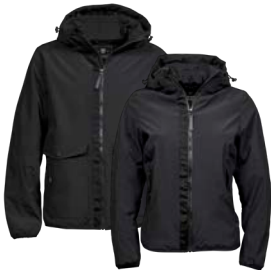
Urban Adventure Jacket | Style 9604 / 9605