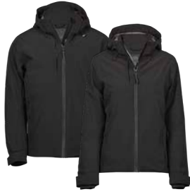
All Weather Winter Jacket | Style 9680 / 9681

The DuPont™ is a patented technology; a performance insulation that provides you with excellent warmth, effortless softness and endless flexibility.