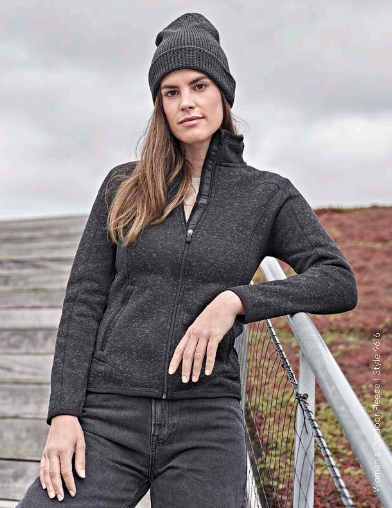
Women's Outdoor Fleece | Style 9616