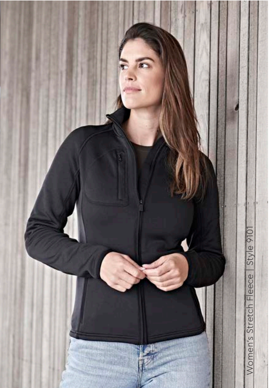
Women's Stretch Fleece | Style 9101