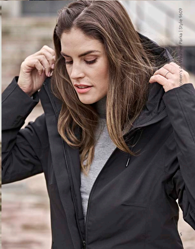
Women's All Weather Parka | Style 9609